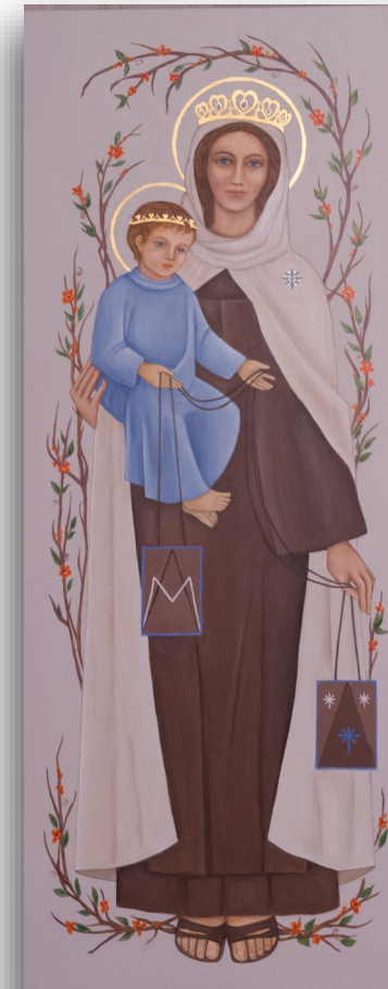
Our Lady of Mt Carmel Oil on Panel, 2000 (?) By Sr Pauline, OCD Carmelite Sisters of Lafayette

Things at the Center are progressing well. We have gotten some roofing projects done and we will soon get a new air conditioner for the dining room and kitchen. We have a new gate system